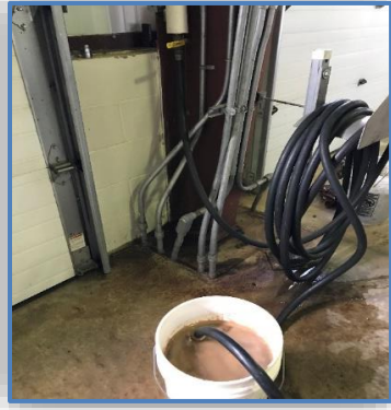
Hose submerged in bucket