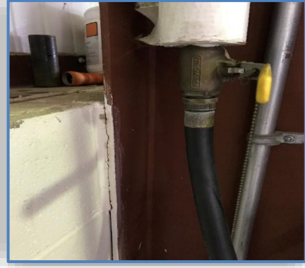
Hose connected with no Hose bib vacuum breaker

If pressure were lost in the system while the bucket was being filled, the dirty water could be siphoned into the drinking water supply! Increases or decreases in pressure can happen when there is a lot of water leaving the drinking water system, such as during a water main break. Even when there is an unusually heavy water demand during something as routine as firefighting, water pressure drops, allowing for back siphonage. Think about what could happen if the bucket were filled with insecticide, or some other toxic chemical! Keep in mind that this can happen at a home, business, restaurant; anywhere an unprotected drinking water line is connected to a contaminant. Various outbreaks of gastrointestinal distress, hepatitis A, and Legionnaires disease have been reported due to instances of unprotected cross connections.