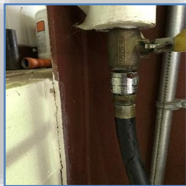
Installed Hose Bib Vacuum Breaker

If pressure were lost in the system while the bucket was being filled, the dirty water could be siphoned into the drinking water supply! Increases or decreases in pressure can happen when there is a lot of water leaving the drinking water system, such as during a water main break. Even when there is an unusually heavy water demand during something as routine as firefighting, water pressure drops, allowing for back siphonage. Think about what could happen if the bucket were filled with insecticide, or some other toxic chemical! Keep in mind that this can happen at a home, business, restaurant; anywhere an unprotected drinking water line is connected to a contaminant. Various outbreaks of gastrointestinal distress, hepatitis A, and Legionnaires disease have been reported due to instances of unprotected cross connections.