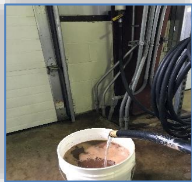
Air Gapped hose to Bucket

The best way is to eliminate all cross connections. This is not always possible, so to take precautions, certain devices to prevent backflow can be purchased. Devices can be installed that stop the flow of water by “automatically shutting their valves” when water attempts to flow backward. These “backflow prevention devices” can be purchased at your local hardware store and are easily installed. Public water systems are required by law to check that their customers’ backflow prevention devices meet certain regulations. Each public water system is responsible for enforcing the required devices and using trained technicians to be sure the devices are working properly. The CT Department of Public Health’s, Drinking Water Section makes sure that all public water systems in CT comply with these laws to provide you with clean drinking water free of contamination.